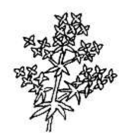
Lady's Bedstraw Yellow Flower June to September