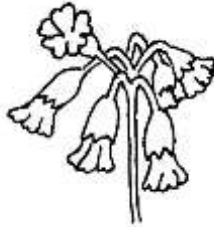
Cowslip Yellow Flower April to May