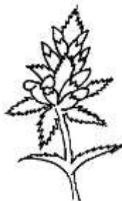
Yellow Rattle Yellow Flower May to September