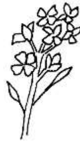
Cuckoo Flower Pale Pink Flower April to June