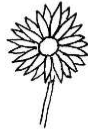
Ox-Eye Daisy White Flower/Yellow Centre May to September