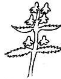
Betony Pink Flower June to September