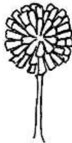
Autumn Hawkbit Yellow Flower August onwards