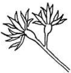
Ragged Robin Pink Flower May to August