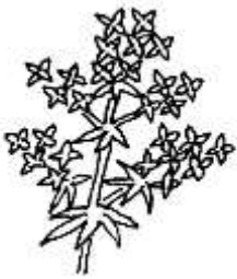
Lady's Bedstraw Yellow Flower June to September